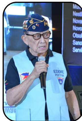
Former President Fidel Valdez Ramos